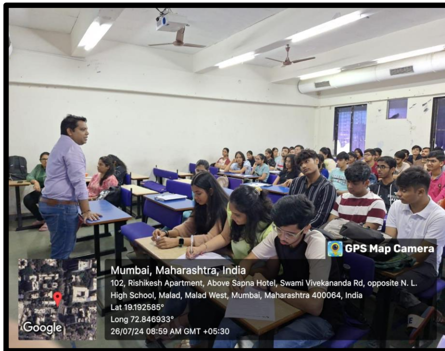
“Students attentively understanding the concept of Overseas education”